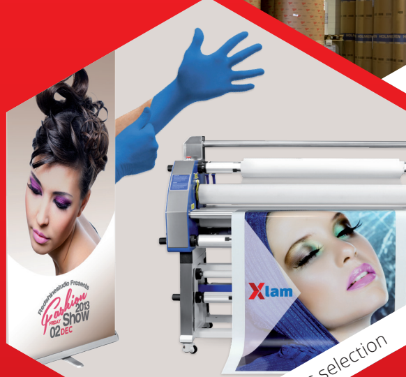
Best products selection